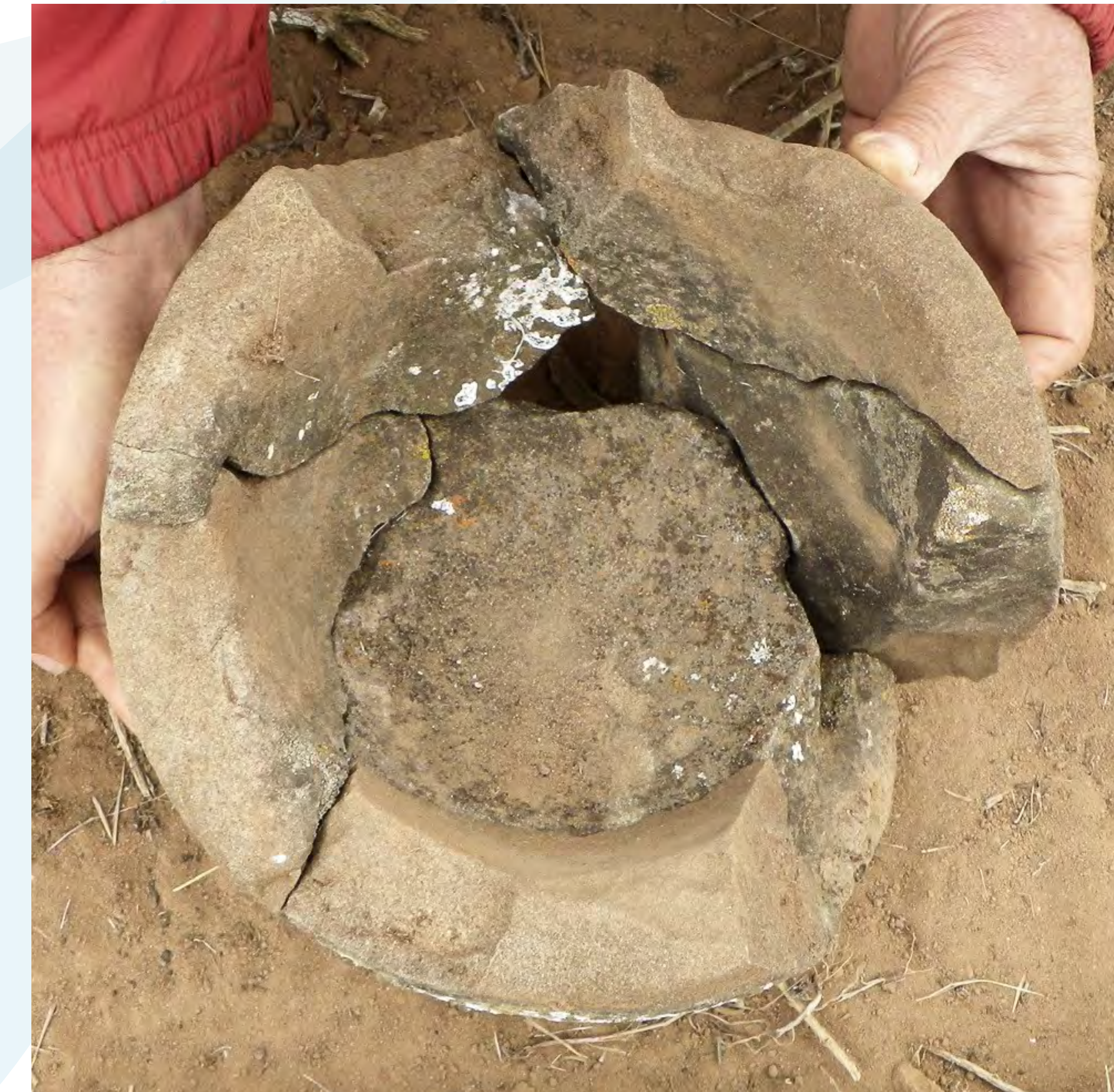
Surface Sandstone Bowl Mortar