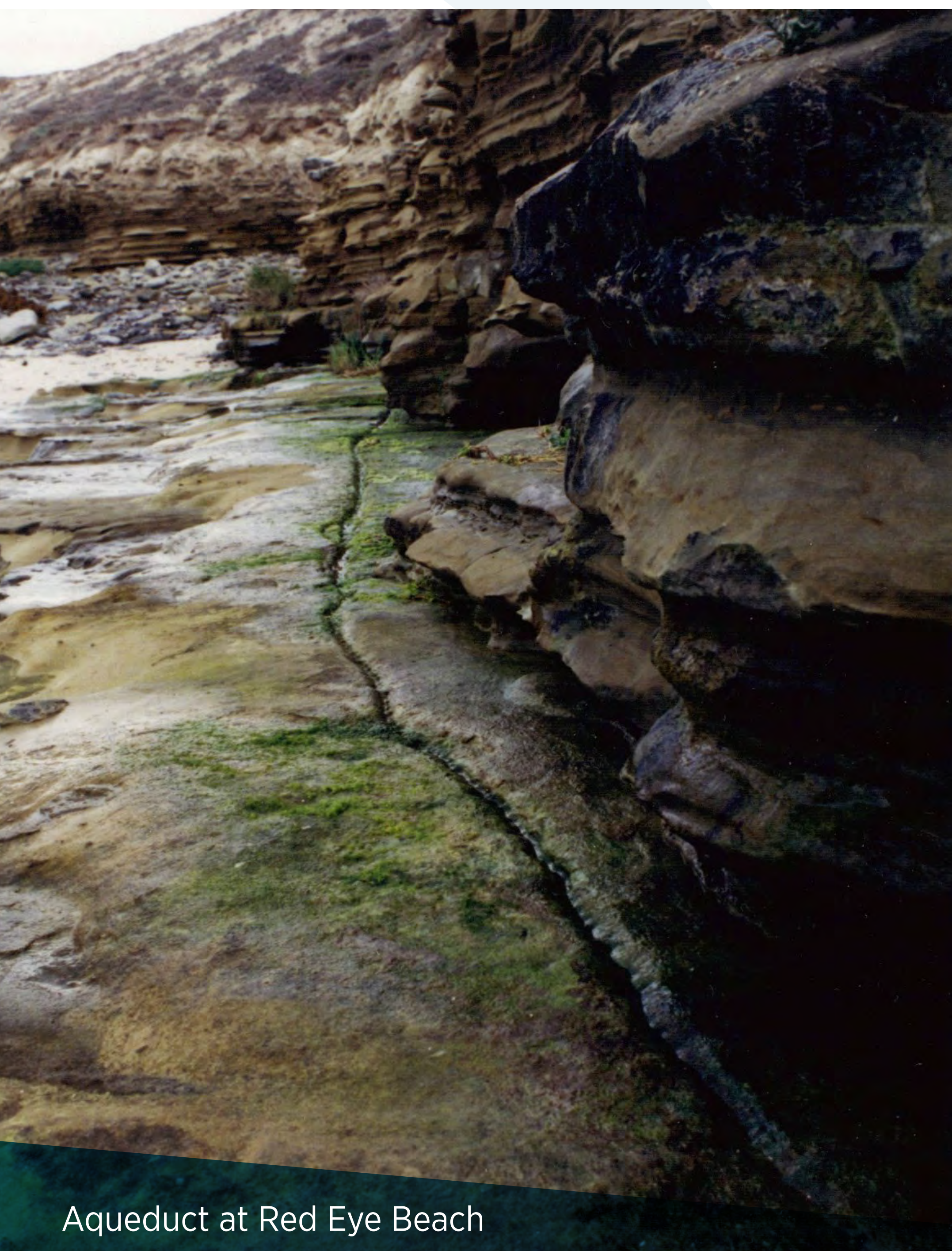
Aqueduct at Red Eye Beach