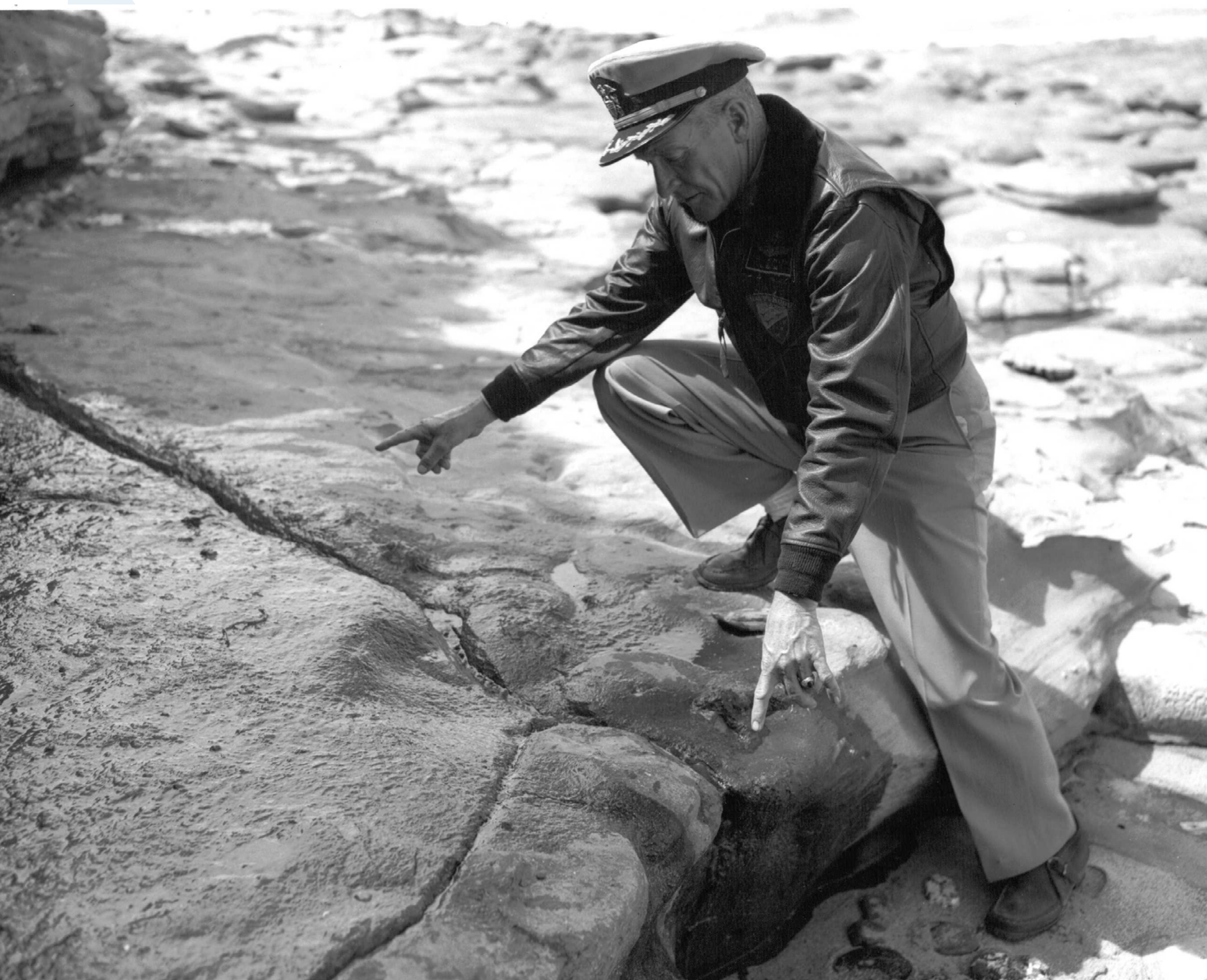
Aqueduct at Red Eye Beach