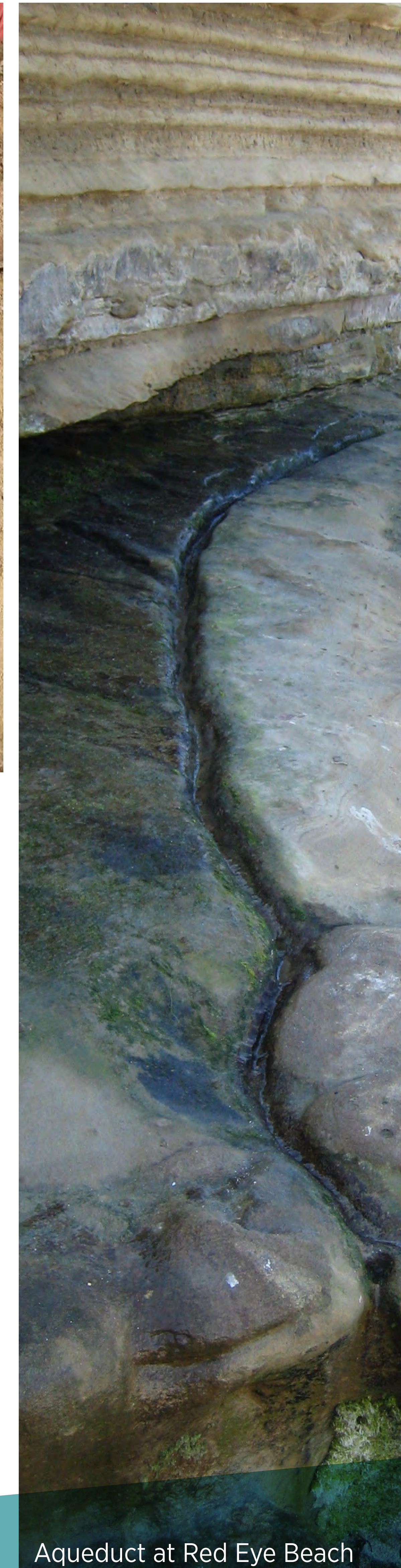
Aqueduct at Red Eye Beach